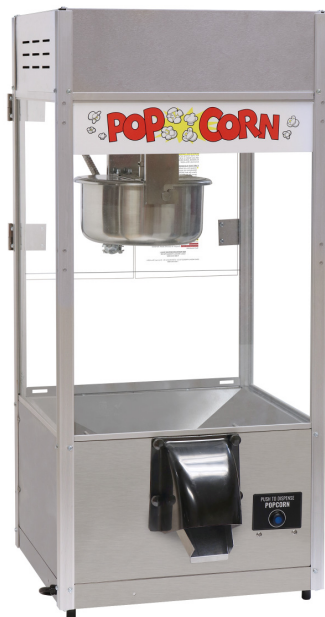
Model 2783-00-000 Front Counter Unit shown