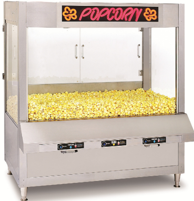
Countertop ReadyServe Unit