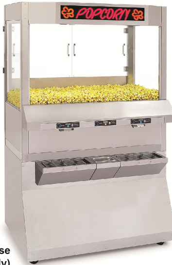
ReadyServe Unit on Base (items sold separately)